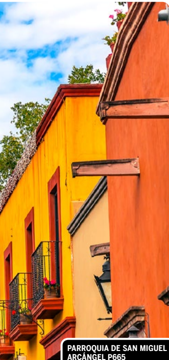
PARROQUIA DE SAN MIGUEL ARCÁNGEL P665