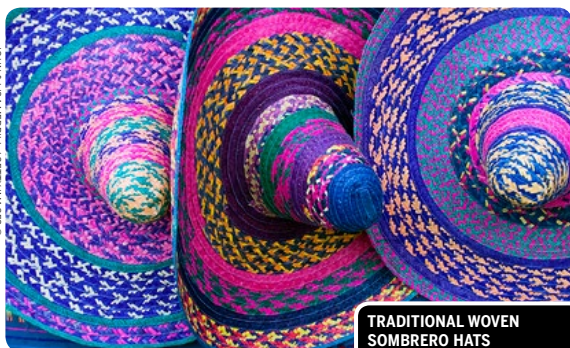
TRADITIONAL WOVEN SOMBRERO HATS