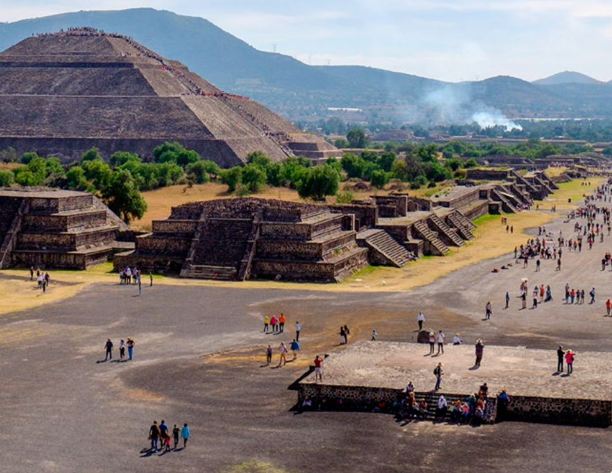
Pirámide del Sol (Pyramid of the Sun; p149), Teotihuacán

all ancient Maya cities, with its backdrop of emerald-green jungle, and Yaxchilán , another marvelous Maya city, accessible only by river.