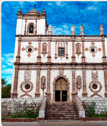
Top: El Arco (the Arch) at Land's End (p740) Bottom: Misión San Ignacio de Kadakaamán (p722), San Ignacio